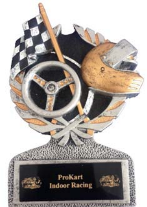
Resin Trophy $12.00 each

A simple, yet unique trophy that stands out from the crowd. At just over 5 inches tall, it features a large text plate for your personalization. The Resin Trophy looks great on the desk back at work.