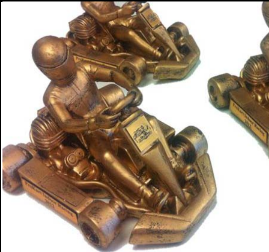
Sculpted Kart Trophies $30.00 each

These premium resin trophies are our most popular item. Measuring 7 inches long, they provide a lot of space to include your event name or company logos on the side pods as well as the front and rear number plates. Looks great on a desk or mantle!