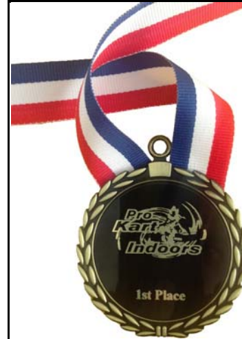
Medals $9.00 each

We have a variety of sayings that range from "Fastest Lap" and "Most Improved" to gag sayings like "Driving Miss Daisy" and "I Got Robbed". Our staff is more than happy to choose the recipients of these awards based on their performance throughout the event.