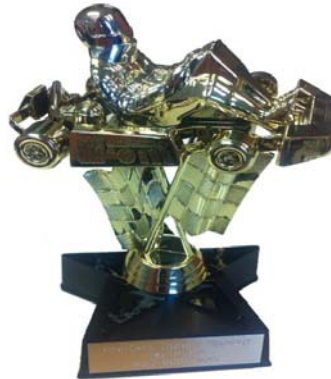
Kart Star Trophy $11.00 each

This economical option that stands nearly 6 inches tall. A large text plate on the front allows plenty of room to add your own text to the trophy.